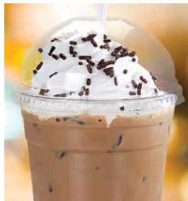
CHOCOLATE FUDGE 340 cal 4.99