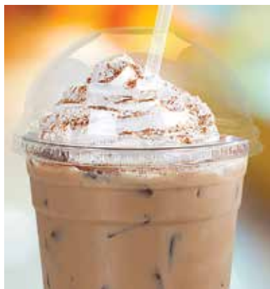
CINNAMON ROLL 340 cal 4.99