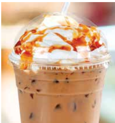
CARAMEL 340 cal 4.99