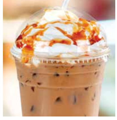
CARAMEL 340 cal 4.99