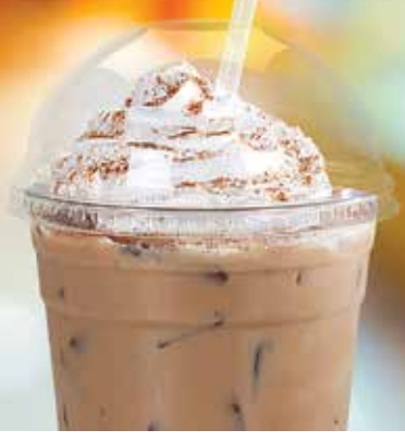
CINNAMON ROLL 340 cal 4.99